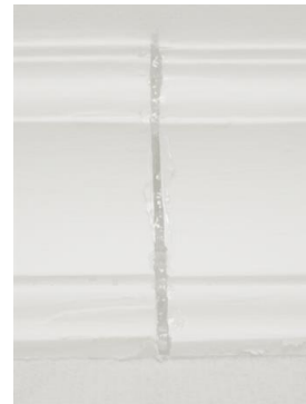
DECOFIX EXTRA AFTER DRYING